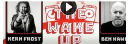
The Wake Up - One In A Million - Iain Clifford - PART 2